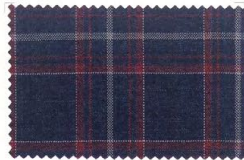
651 - 733 / 1200 100% Wool 150cm 250g Navy / Maroon / White