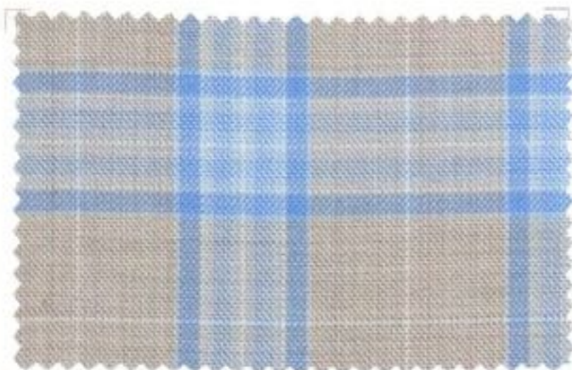
653 - 409 / 1000 100% Wool 150cm 250g Beige / Light Blue