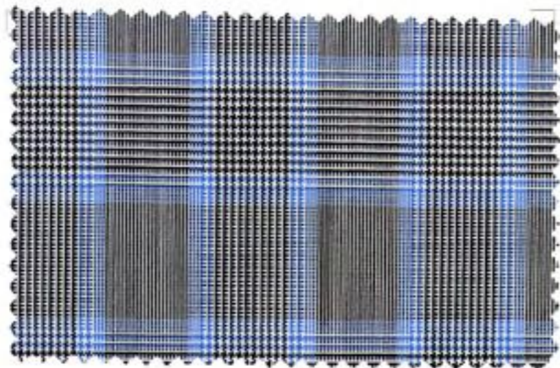
631 - 031 / 900 100% Wool 150cm 230g Black / White / Sky Blue