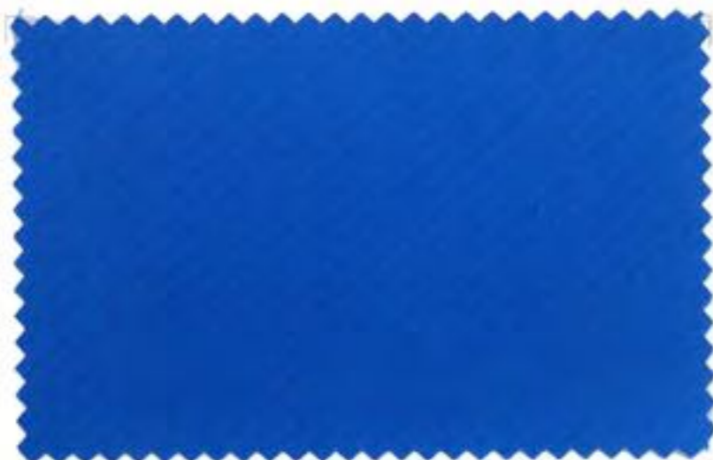
614 - 323 / 500 97% Supima Cotton 3% Lycra 145cm 290g Blue