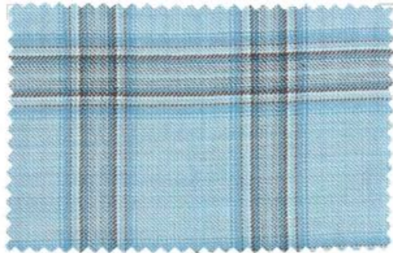
651 - 777 / 1200 100% Wool 150cm 250g Mint