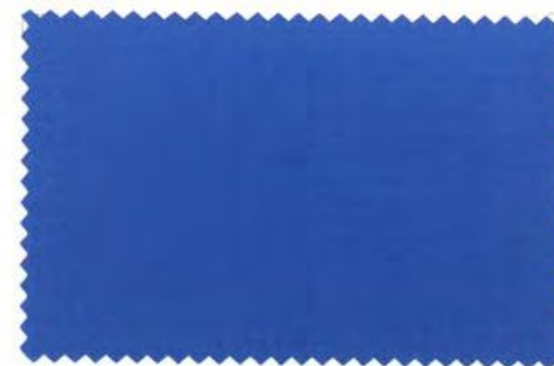
602 - 253 / 600 100% Wool 150cm 270g Blue