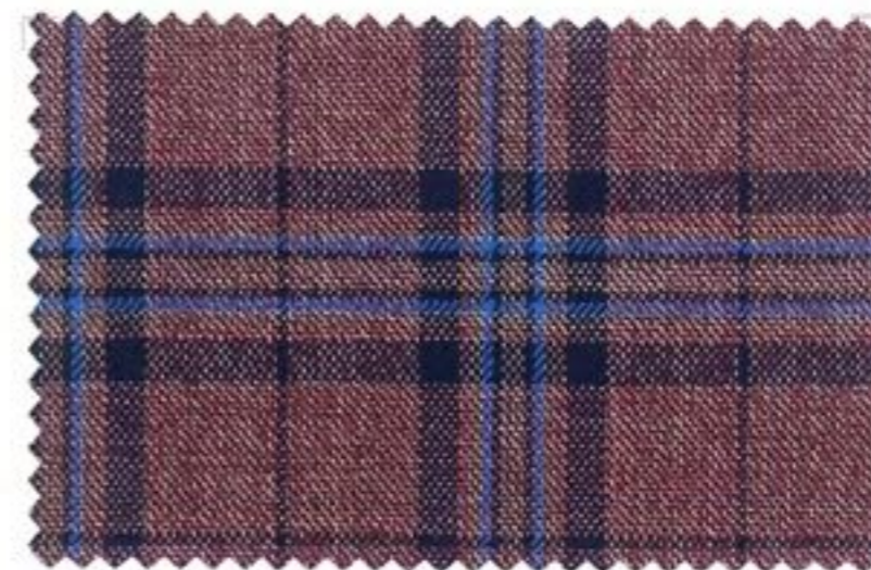
653 - 415 / 1000 100% Wool 150cm 250g Red / Black