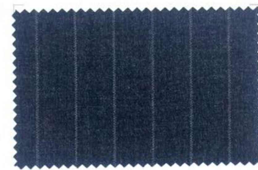
621 - 027 / 800 100% Wool 150cm 260g Charcoal