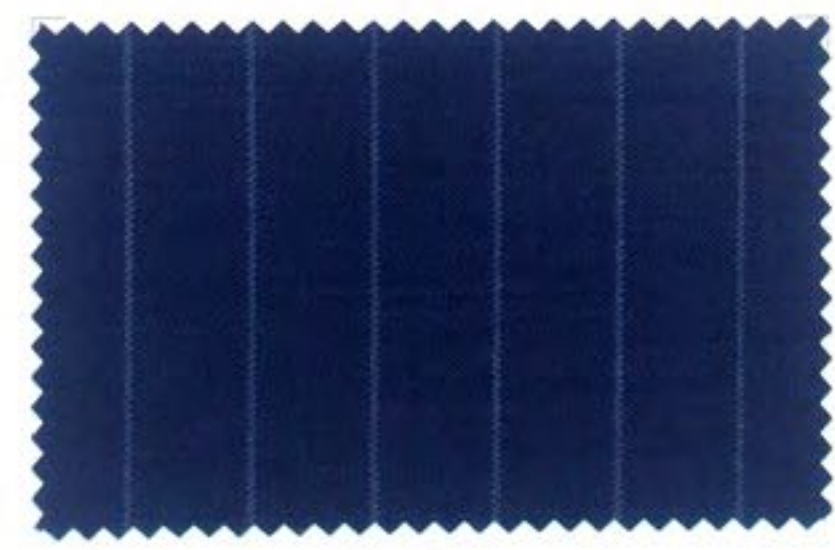
621 - 028 / 800 100% Wool 150cm 260g Blue