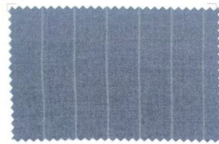
621 - 026 / 800 100% Wool 150cm 260g Grey